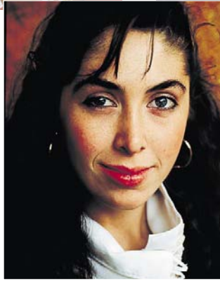
Republic of Georgia

To express their gender, people follow the guidelines of their culture. As you can see from these photos, the guidelines for demonstrating femininity and masculinity vary widely from one culture to another.